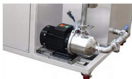
Pressure Pump CE rated CNP pum