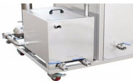
Oil catch can.