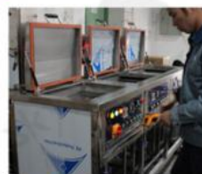
8 Age Testing