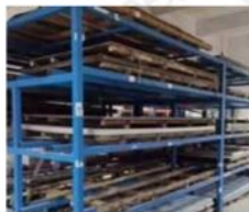
1 Raw Material