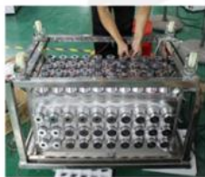
4 Transducer Installation