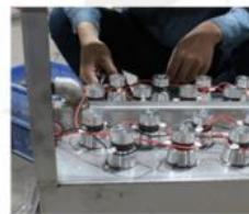
5 Skymen Transducer Wiring