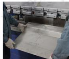
2 Board Cutting