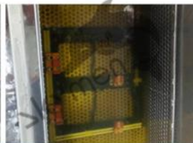
Fixture industry application