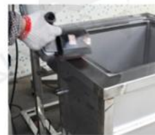
6 Tank Polishing