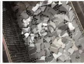
Copper, aluminum, stainless steel, hardware industry applications