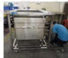
3 Tank Welding