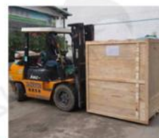
9 Skymen Factory Shipping