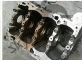
Auto parts, aviation, shipbuilding, industry applications